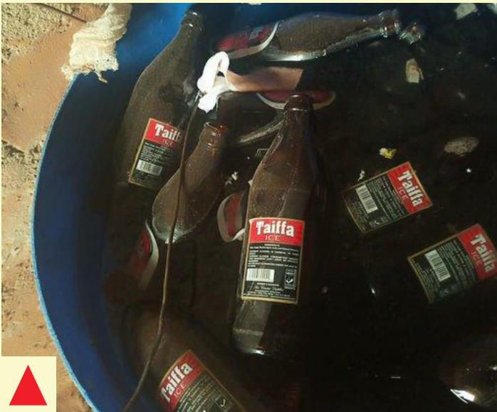
Several of the empty bottles that were being used by the perpetrators to repackage the bogus counterfeit branded alcohol.