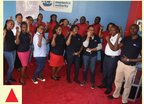
ACA staff members pose for a group picture.