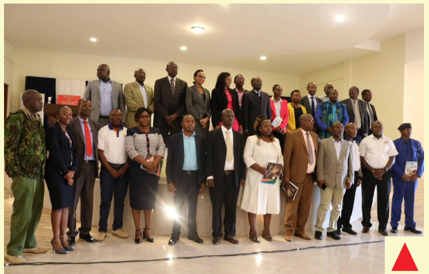
County & National Government Officers pose for a picture with the ACA team after the sensitization forum followed by the county business community sensitization forum at the Semara Hotel in Machakos