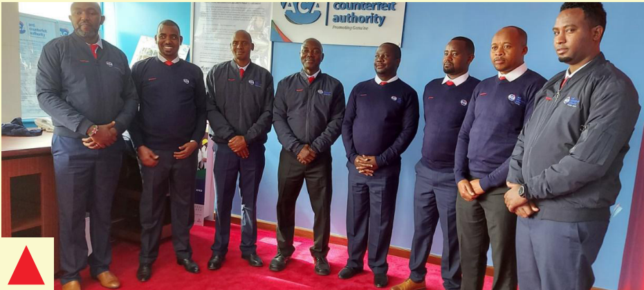
The ACA inspection team.

The non-physical rebranding involved Logo redesigning that was incorporated in the ACA website and social media platforms as well as email signatures. The physical re-branding involved stationeries and Information education and communication materials, all staff uniforms including Front line staff, enforcement staff uniforms, and complementary items. A uniform refresh ensured we are on the trend and identifiable with an immediate point of difference.