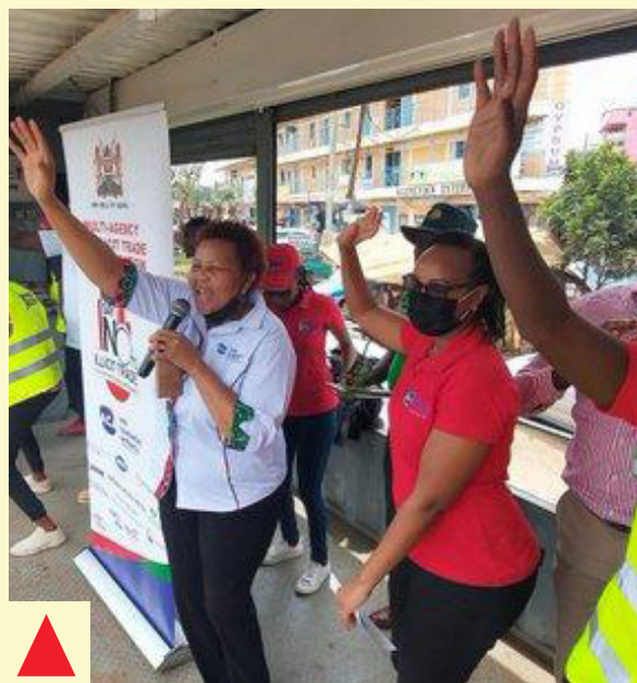
The ACA team rallies the crowd.